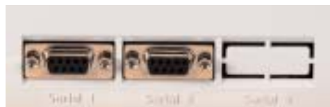
Two Standard RS-232C Ports