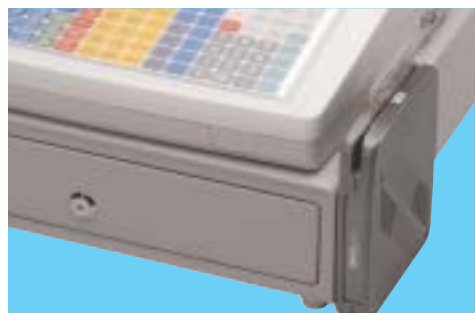
DataTran™ Integrated Credit Option