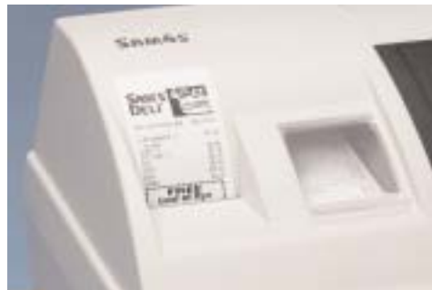
Quick and Easy Drop-In Paper Loading