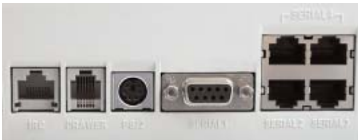
Multiple Ports Standard

Dealer Line Products Division www.crs-usa.com