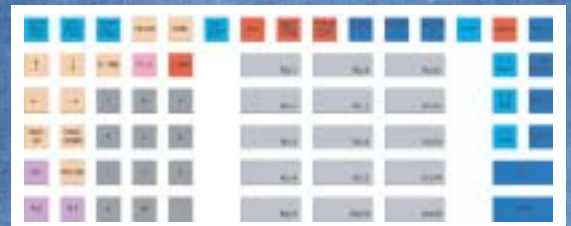
SER-7040 Raised Key Keyboard Standard Keyboard Configuration