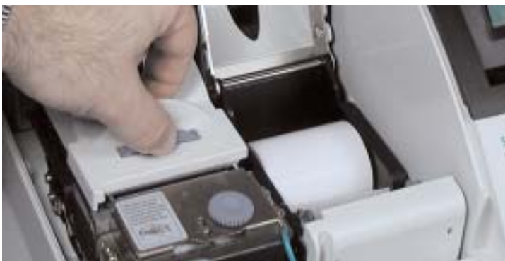
Quick and Easy Drop-In Paper Loading